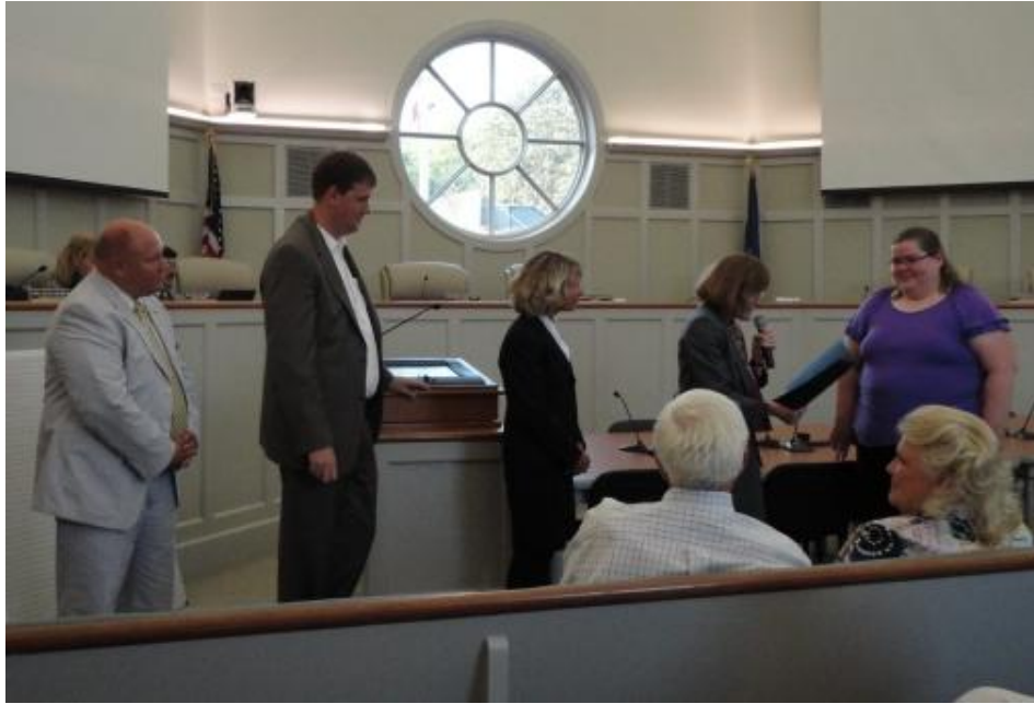
Town of Purcellville, Virginia